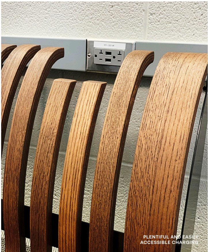
PLENTIFUL AND EASILY ACCESSIBLE CHARGING