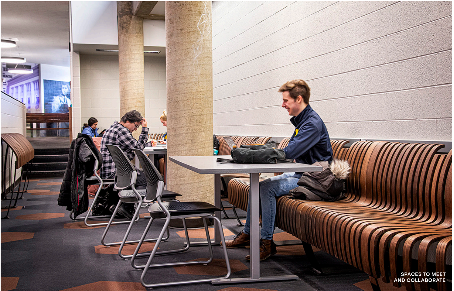
SPACES TO MEET AND COLLABORATE