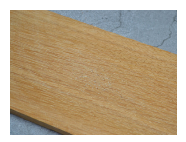
Let the oil dry. Drying time is 12 hours until completely dry.