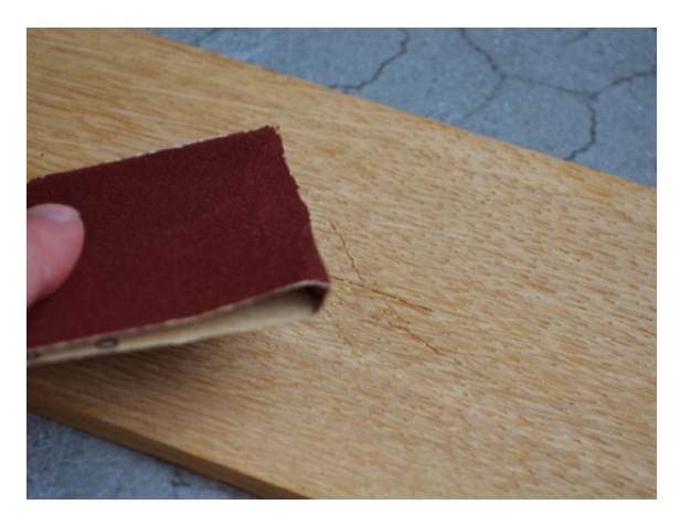
Sand of the worst part of the scratch