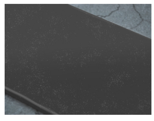
Metal parts will collect dust

All metal parts are powder coated wich is a very durable surface treatment. The maintenance for metal parts only consists of cleaning. The cleaning can easily be done by whiping surfaces of with water and a cloth.