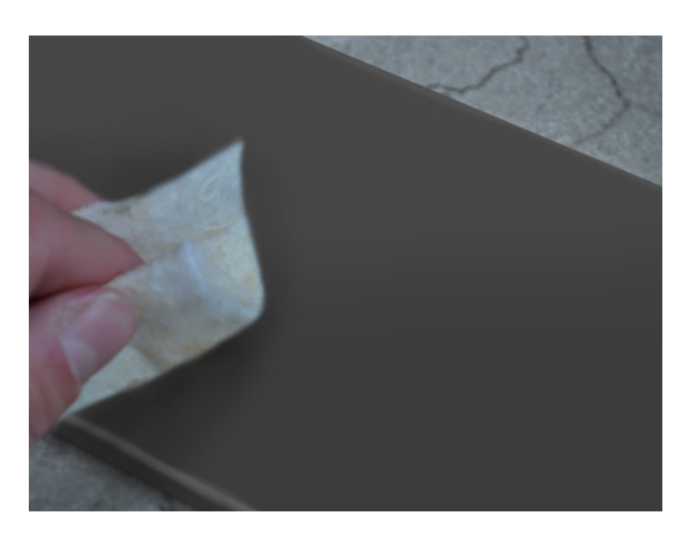
Whipe of with a wet cloth