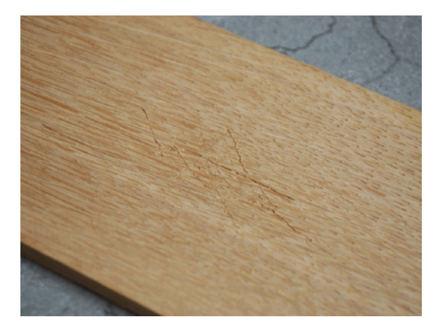
Scratched wooden part

Scratches can be touched up by local treatment with Rubio Monocoat Oil Plus 2C. Use the natural or pigmented oil depending on the ribs original treatment. Small damagees will be less visible and the oil gives the injured surface back it's surface protection. Maintenance cycle depends on rate of use/wear. Use the Rubio Monocoat Plus 2C oil to touch up the top layer of the wooden parts of the bench. This is a two component mixture. One can is the natural or pigmented oil and one can is the hardner. Mixture ratio is 3-1. Continius surface care minimizes visable scratches and marks. This treatment will help protect the bench.